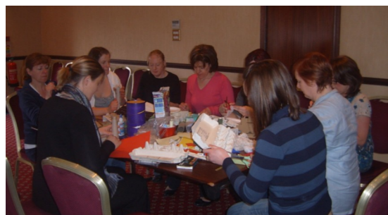
Getting to Grips with 'Junk Art' during the Play in the Home Environment seminar in Carlow

Childminders in Kilkenny provide a valuable service in the community and play a vital role in the lives of minded children and their families. Childminding Week is an opportunity to celebrate all their hard work!